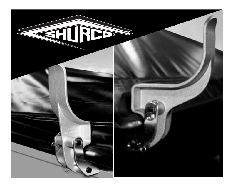
Top: Shur-Co's redesigned Easy-Off Tarp Stop, with its taller height and patented curved tip, helps prevent rubbing against the tarp. Bottom: The 6-inch offset style has also been updated for the same advantage.