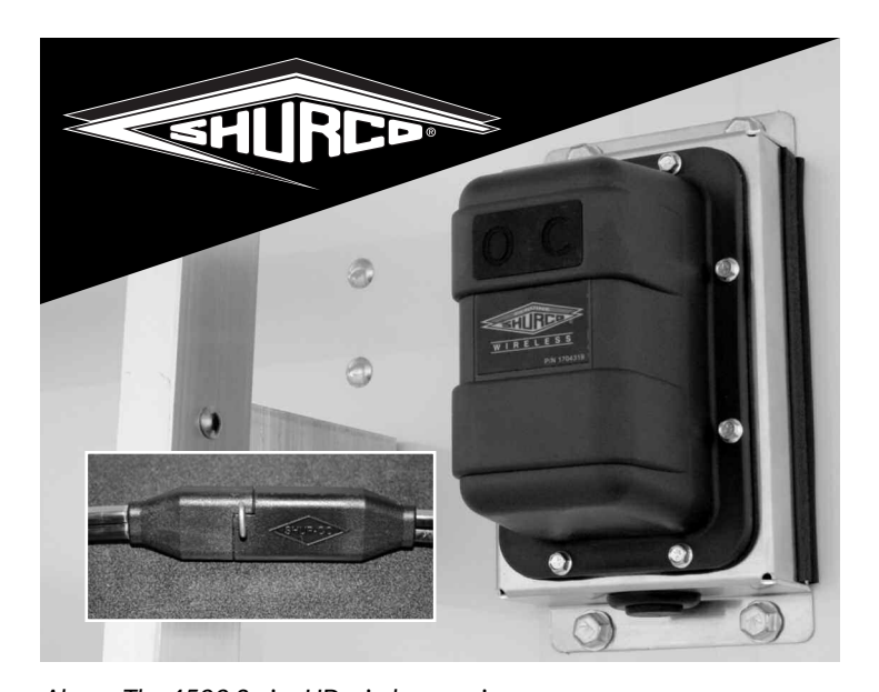
Above: The 4500 Series HD wireless receiver. Inset: SMARTwire™ sealed harness for easy installation.