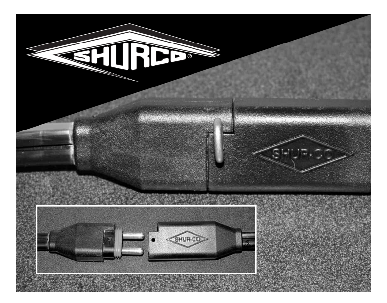
Above: SMARTwire<sup>™</sup> sealed harness for plug-and-play installation. Inset: SMARTwire<sup>™</sup> unplugged.