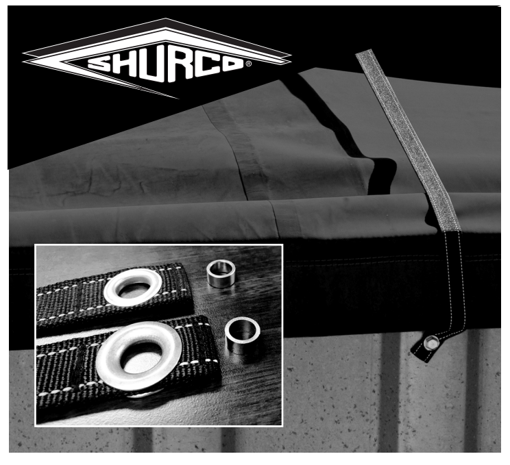
Top: GustBuster<sup>™</sup> tarp cords belt on and stay on. Inset: The grommeting has changed to a smaller size and different composition for improved corrosion resistance and a more balanced appearance. Below: The dual-grommet design lets you fit the two most common widths of today's trailers.