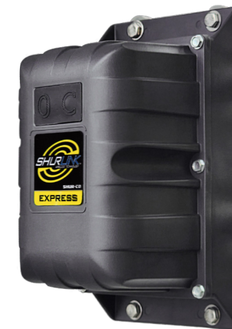
Two-Piece Solenoid Enclosure