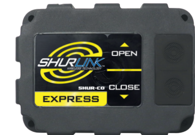
Mini-Module Style Enclosure