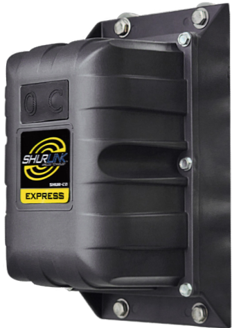
Two-Piece Solenoid Enclosure