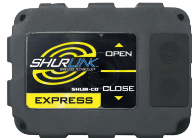
Mini-Module Style Enclosure