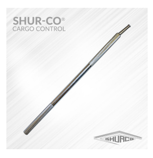
32" Chrome Winch Bar