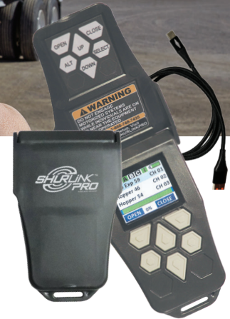
ShurLink™ PRO Remote