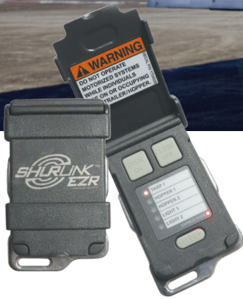
ShurLink EZR™ Remote